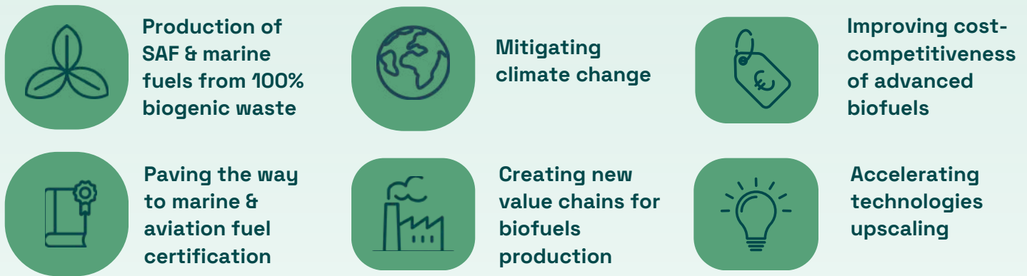
Figure 2: FUEL-UP Project Key Objectives.