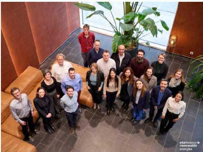
Figure 6: KOM in Brussels, February 2024.

After this meeting, the partners met for the second consortium assembly in September 2024