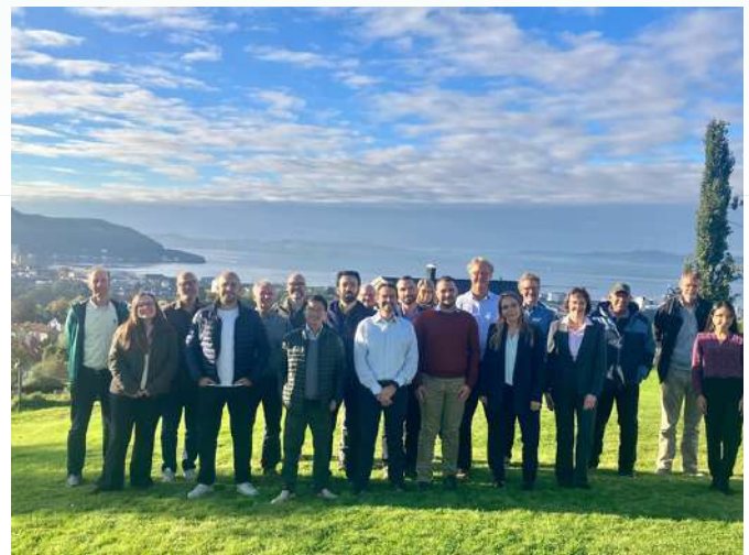
Consortium Meeting in Trondheim, September 2024.

The partners enthusiastically discussed the project research progress after 9 months of activities, presented their future plans and got the opportunity to visit SINTEF Ocean Maritime Energy Systems Laboratory and SINTEF Industry Tiller Lab.