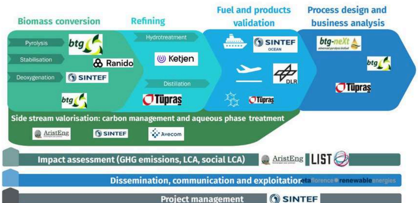
Figure 3: Value Chain of FUEL-UP Project.

The working area related to the preliminary process design, feasibility study, techno-economic assessment is aimed at delivering a design of a commercial plant including cost estimate as well as of a preliminary techno-economic assessment of the production of SAF and marine fuels via pyrolysis and at implementing a screening study concerning suitable biogenic feedstocks , product applications and fuel market. A start document is prepared by BTG-Next defining the boundaries and constraints of a full-scale plant. A screening study is also carried out by BTG-Next for the complete value chain from biomass sourcing until the distribution of the advanced biofuels.